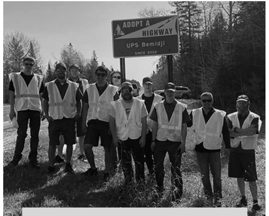
The UPS Crew

~Submitted by: Highway Engineer, Bruce Hasbargen