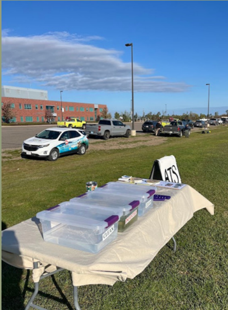
AIS Table at the Beltrami SWCD Water Festival, October 2025