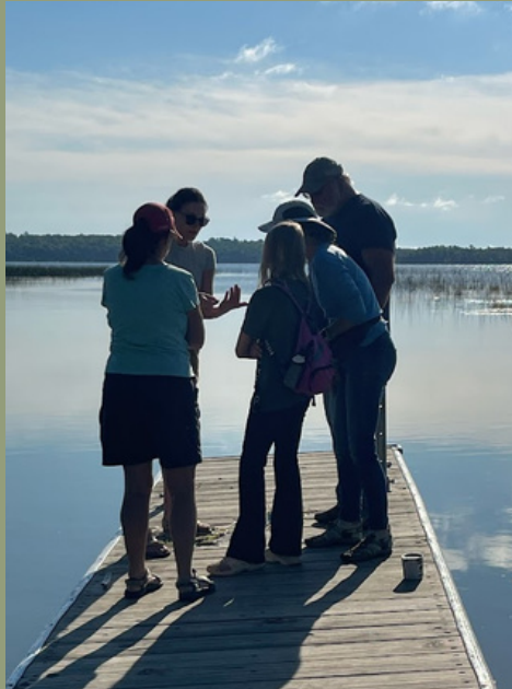
Starry Trek volunteers learn how to ID starry stonewort, August 2025