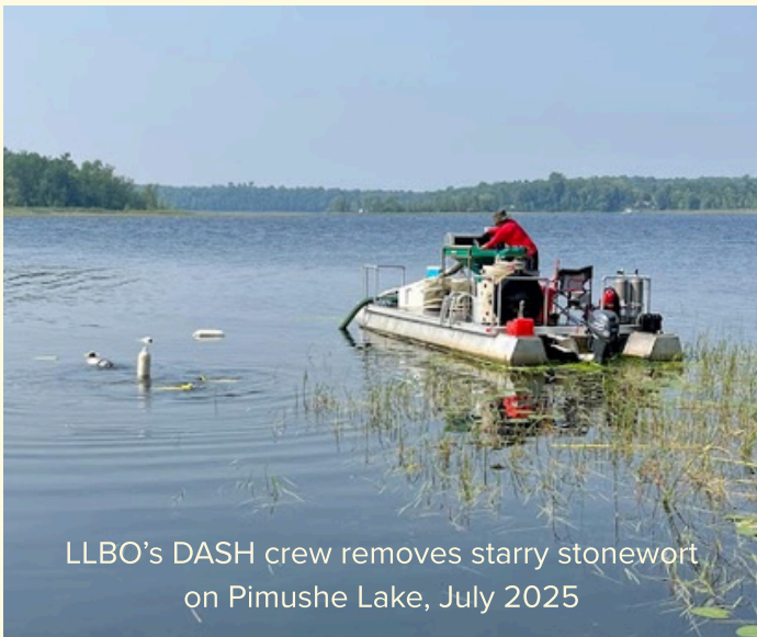
LLBO's DASH crew removes starry stonewort on Pimushe Lake, July 2025

Routine vegetation sampling is conducted across all Beltrami County lakes to monitor growth of known infestations, gauge management decisions, + for early detection of any possible AIS.