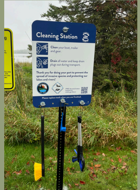
1 of 6 'Cleaning Tool Stations' installed for TRWA PWAs, September 2025

In 2025, the AIS Technician made connections, educated over 150 students on AIS identification + prevention at two 5th grade Water Festivals, assisted local resort owners in identifying AIS at private accesses, presented at numerous lake association meetings , hosted a local training site for Starry Trek , + aided the Turtle River Watershed Association in installing 6 Cleaning Tool Stations at local PWAs .