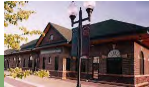
Beltrami County History Center